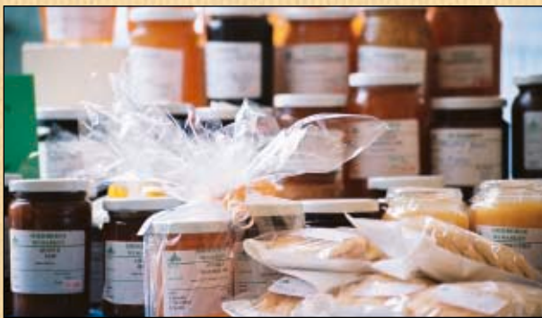
below: One of the lovely stalls